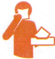
Coughing and sneezing