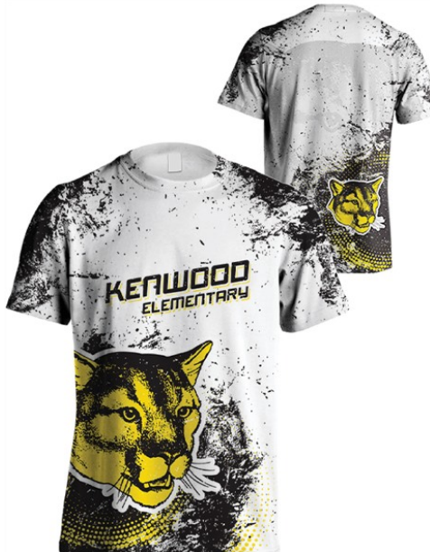
YTH/ADULT DYE SUB SPLATTER