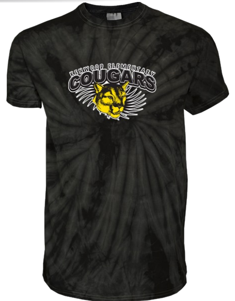
YOUTH/ADULT SPIDER TIE DYE