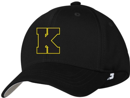
YOUTH/ADULT FLEXFIT® CAP