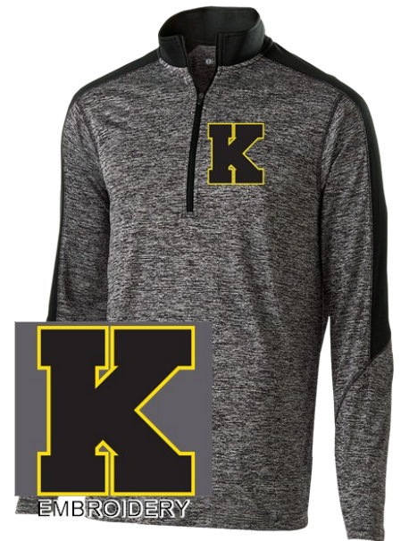
M/W/Y 1/2 ZIP