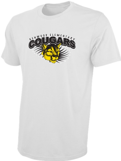
YOUTH/ADULT 50/50 TEE