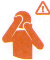
Touching an object or surface that has the virus on it, then touching your mouth, nose, or eyes.