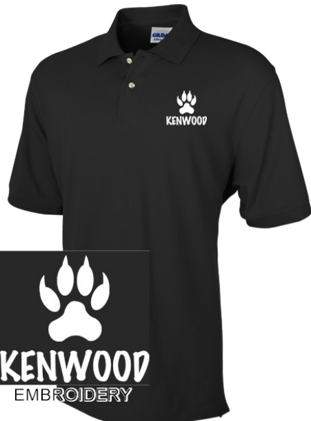
YOUTH/ADULT JERSEY POLO $23