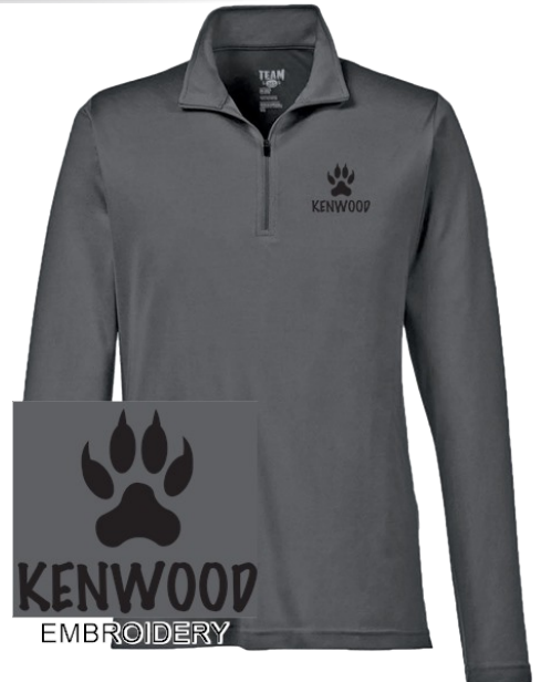
M/W/Y PERF ZIP PULLOVER $29