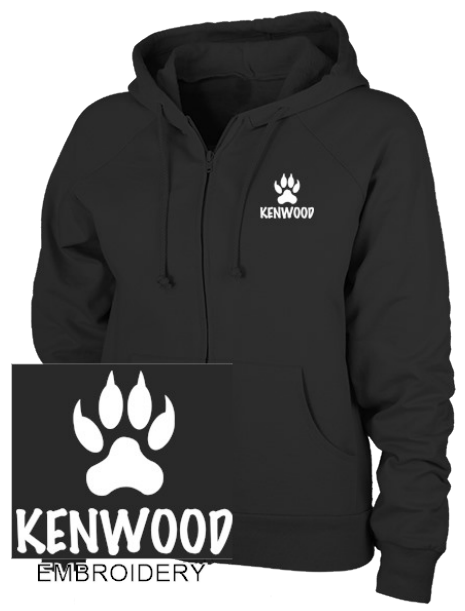
ADULT/YOUTH FULL-ZIP HOODIE $38

10% Of Every Purchase Directly Supports KENWOOD SCHOOL ASSOCIATION