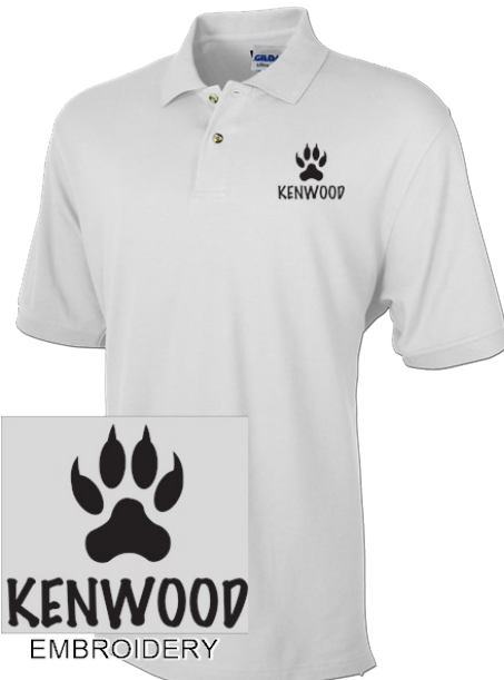
YOUTH/ADULT JERSEY POLO $23