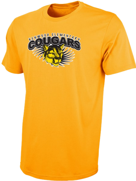
YOUTH/ADULT 50/50 TEE $15