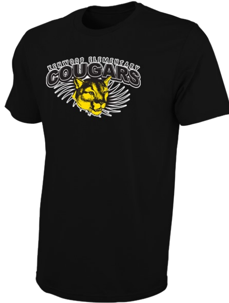
YOUTH/ADULT 50/50 TEE $15